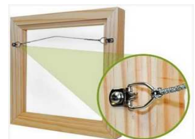
Hanging wire and D-rings