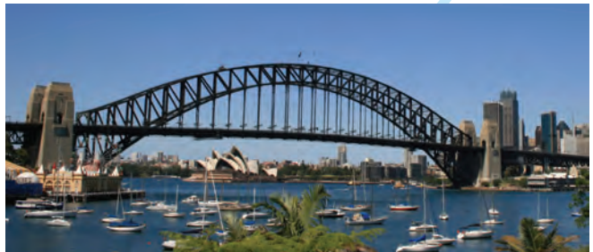
Sydney Harbour Bridge