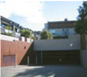
Figure 22.3-1: Secure basement car parking.