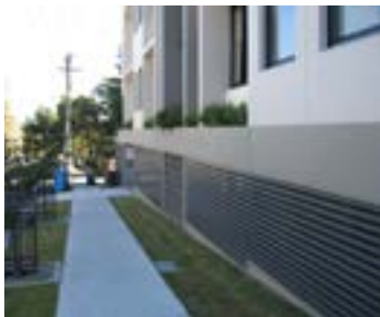
Figure 22.3-2: Ventilation grilles to basement car park are well integrated with overall facade design.