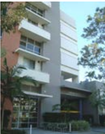
Figure 22.2-2: Vehicle entries that are well integrated with overall facade design.