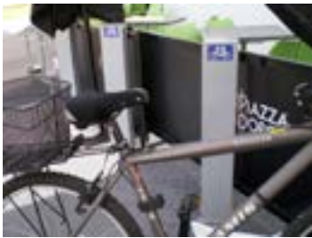
Figure 22.7-1: Bicycle Stands