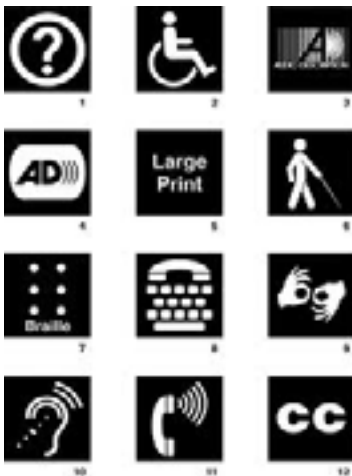
Figure 22.1-1 International Symbols for Facilities