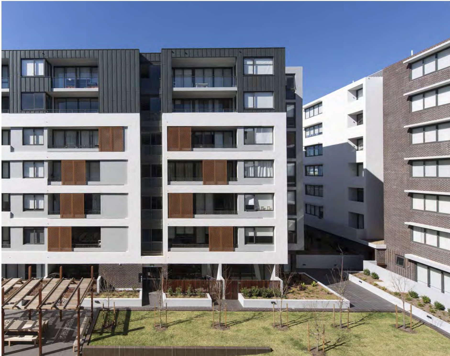
Erko Apartments, Sydney