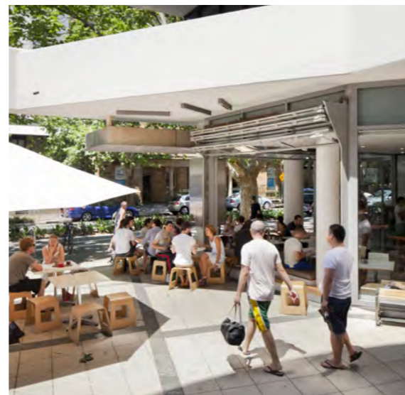
St. Margarets, Sydney