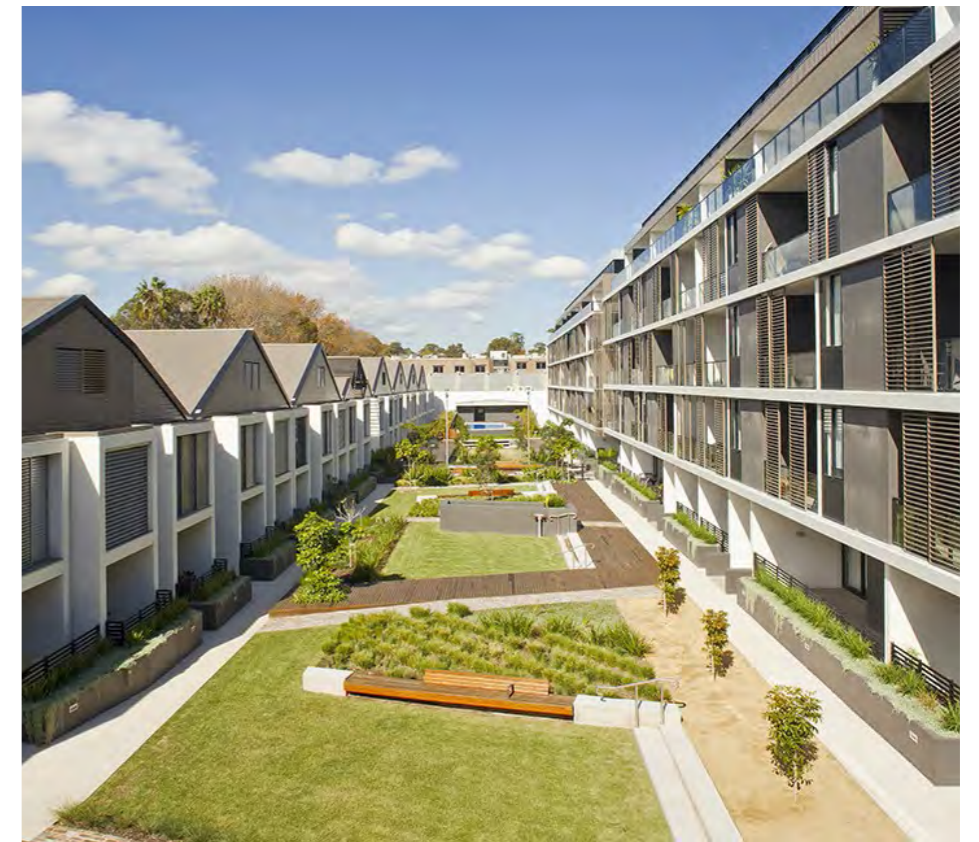
Gantry Apartments, Sydney