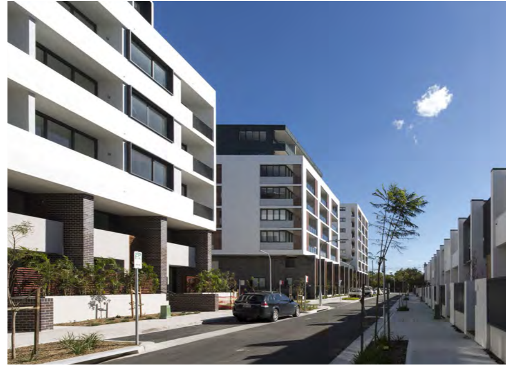
Erko Apartments, Sydney