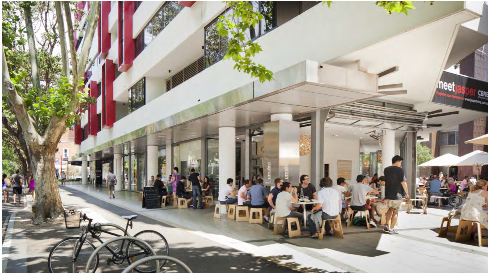
St. Margarets, Sydney