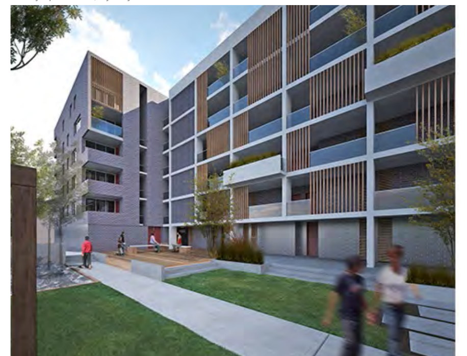
North Eveleigh Affordable Housing, Sydney