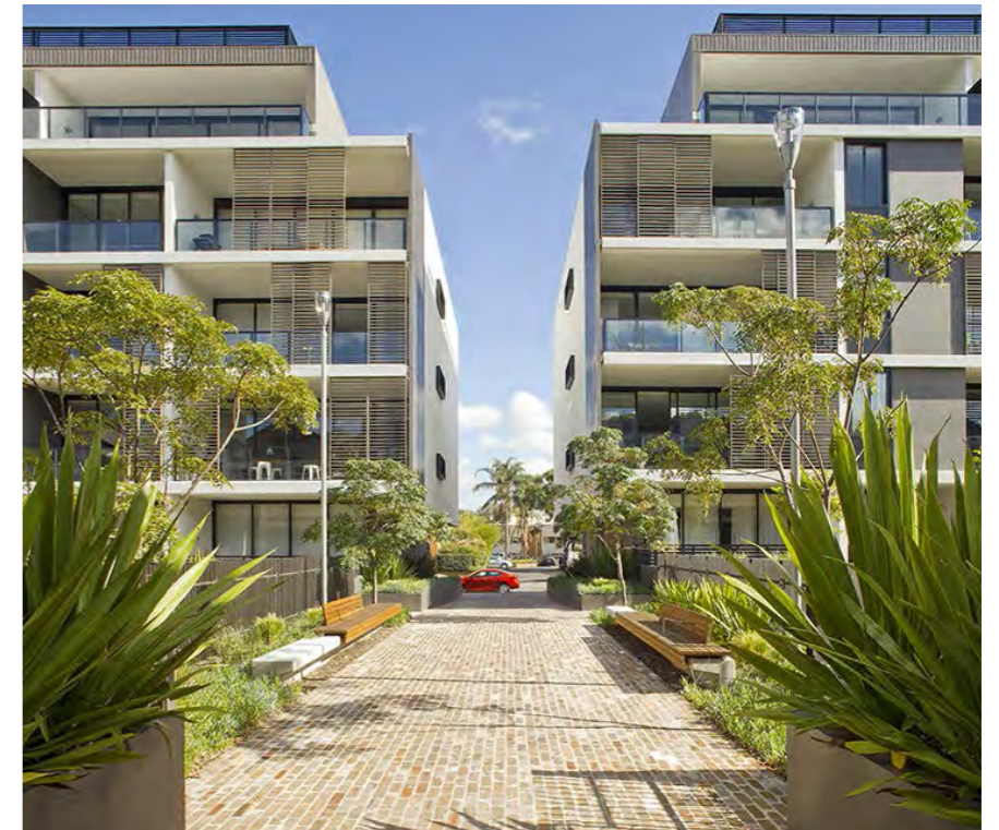
Gantry Apartments, Sydney