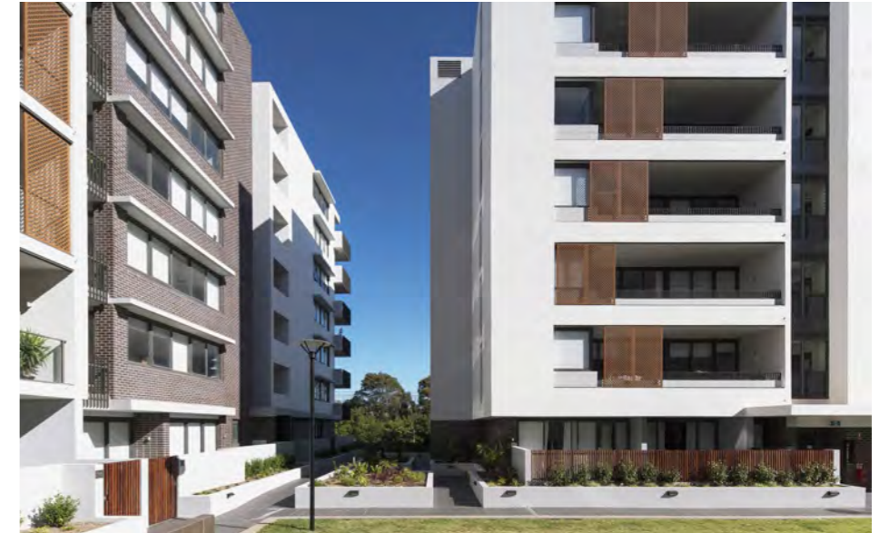
Erko Apartments, Sydney