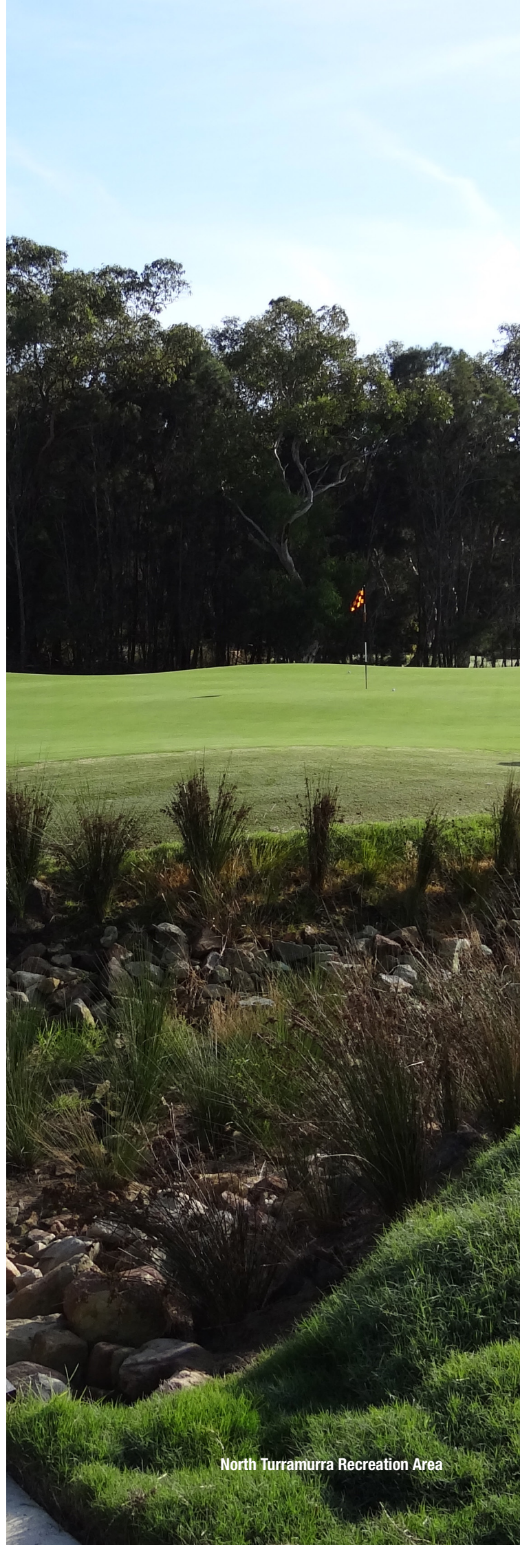
North Turramurra Recreation Area

The reasoning for Council to divest of these assets is to ensure that Council meets the future needs of the community by providing purpose built facilities and maintaining financial sustainability. The Long Term Financial Plan identifies asset sales as a short, medium and long term funding strategy which relies in part on the future reclassification of land from Community to Operational. This relies on a collaborative approach with State Government in negotiating a path through the planning process which has not always yielded outcomes which Council considers fair, timely, or transparent.