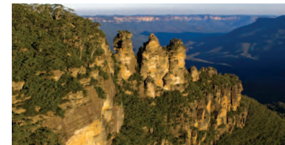
The Three Sisters, Katoomba

TIP: Take regular breaks from driving. Also get a good night's sleep before commencing a long trip. For more information on driver fatigue: www.rta.nsw.gov.au Remember your E-Toll Tag for this trip.