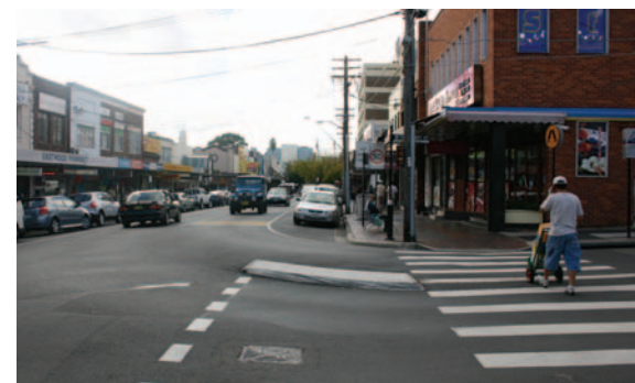
Rowe Street, Eastwood

ARRIVE: Eastwood Shopping Centre car park, Trelawney St, Eastwood