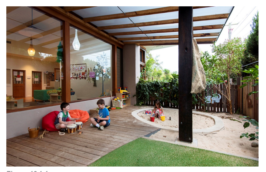
Figure 10.1-1 Example of good design of outdoor play areas

Note : Council requires an acoustic assessment be undertaken by a suitably qualified acoustic consultant that is to include recommended noise attenuation measures.