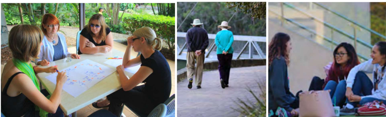
Figure 1: SIA ensures that different sectors of society are considered.

The inclusion of SIA in land use and development decision-making enables Ku-ring-gai Council to develop the commitment, systems and practices that provide a greater democratic and responsible government.