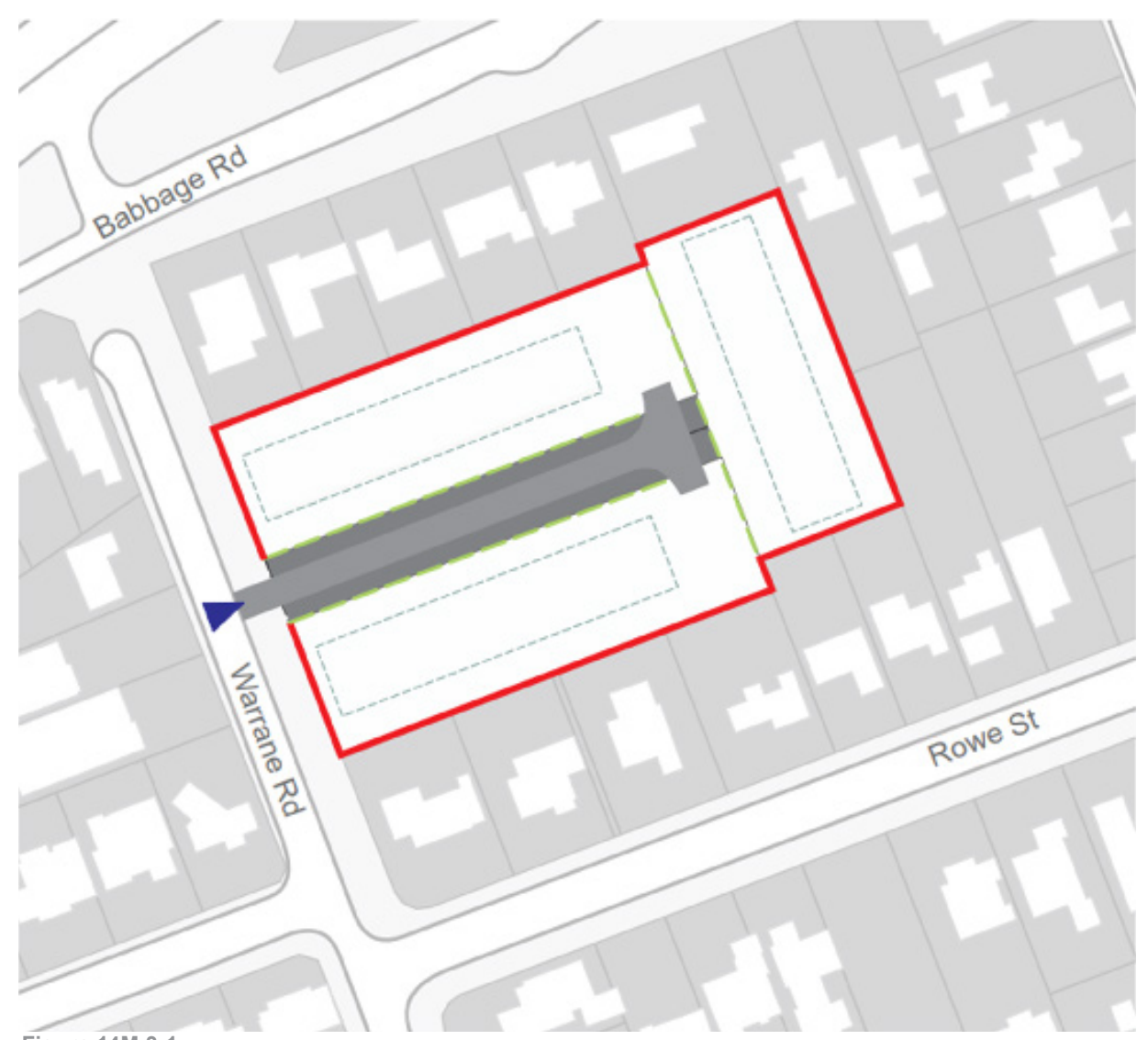
Figure 14M.3-1: Planned Building setbacks