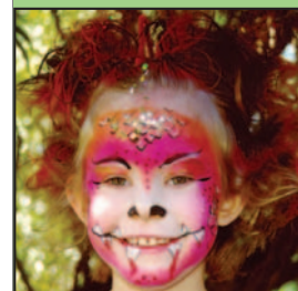
Face painting at the Festival of Wildflowers

Australian Plants Society North Shore Branch Tuesday morning Walks and Talks Program